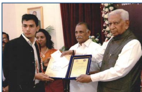
Student of Surana Honored by Governor of Karnataka