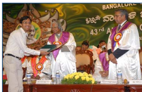
Student of Surana Honored by President of India